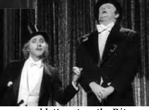
and let's put on the Ritz.