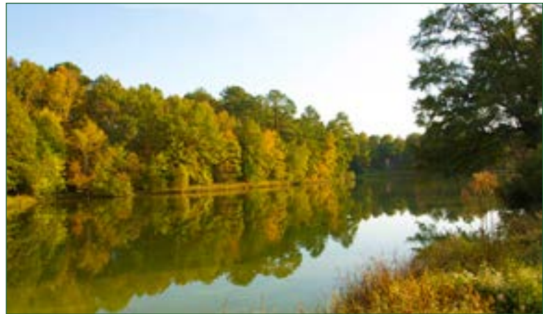
Photo of Falconbridge lake

You will soon be receiving your notice about participating in the annual Luminaries event. This is a wonderful holiday tradition that brings neighbors together and creates a spectacu-