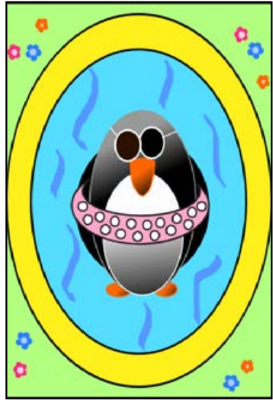
Pool Opening COOKOUT 11:30-1pm Bring side or dessert.

roll, please... the Recreational Facilities Committee (formerly known as the Pool Committee) has just announced that for 2015, the annual Initiation Fee has been waived! Yet another reason to join us for a summer of swimming, paddling, and splashing in the clear blue sparkling water, and meditation, contemplation, reading, or dozing as you choose beneath a poolside umbrella. Yes, we've